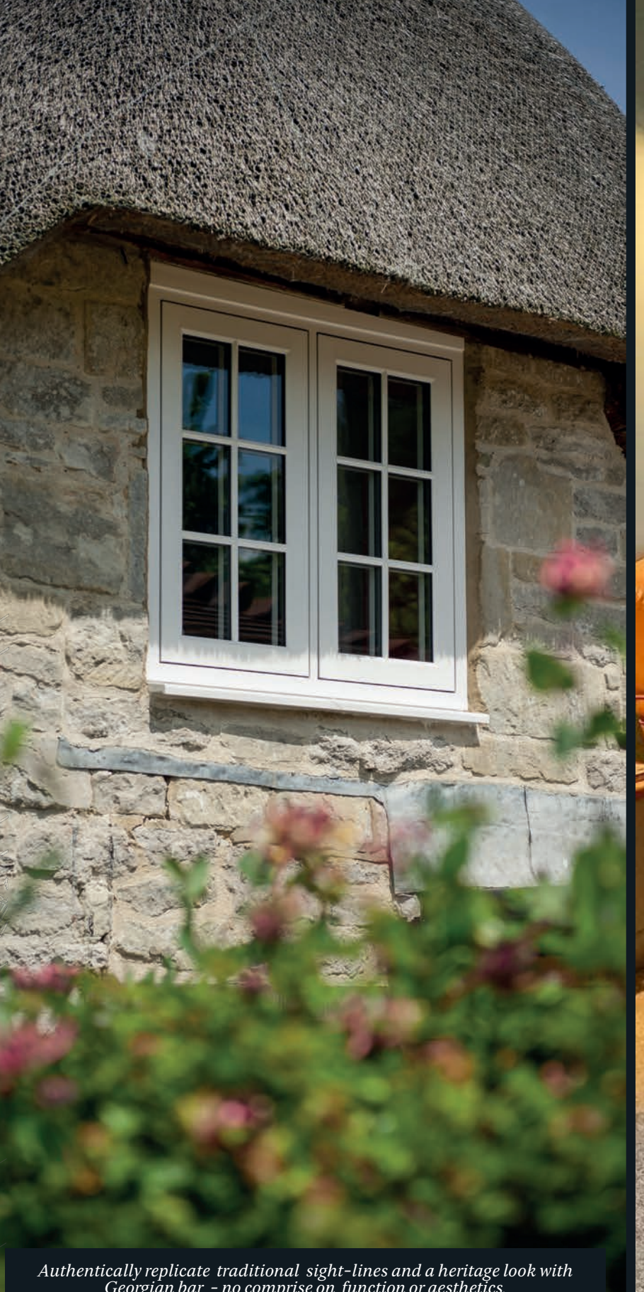
Georgian bar - no comprise on function or aesthetics.

For most homeowners, the style of their property will inform the design choices they make, so if you live in a Conservation Area Residence 9 can help enhance both appearance and performance, we have proven experience in helping to restore the original character of properties in hundreds of Conservation Areas, always with an eye to any planning considerations. We have also been approved in a number of Grade II Listed properties. If you are in a location with more design freedom R9 can help bring your ideas to life, balancing design and practicality to enhance your home, whilst still maintaining traditional looks.